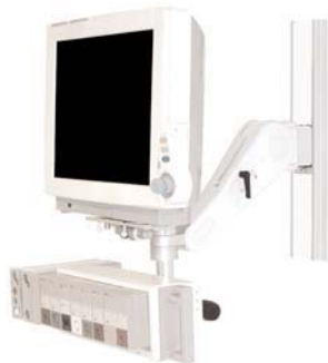
VHM™ Variable Height Support Arm Kit AG-0018-25 Includes: VHM Arm, Down Post for Flexible Module Server (FMS), Mounting Plate for IntelliVue Table Top Adapter, and Channel Cover. Channel sold separately.

Provides variable height positioning - 17" (43.2 cm) Range, lateral positioning, independent display/FMS swivel, and display tilt