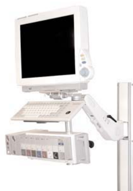
MP60/70 Keyboard Mounting Bracket AG-0018-86 Permits a keyboard to be added to MP 60/70 mounts. Can optionally accept a 9" (22.9 cm) Keyboard Plate WM-0023-39, or 17" (43.2 cm) Keyboard Plate WM-0010-60.