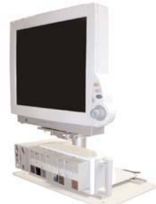
Camlock Mount AG-0018-83 Permits system to be mounted where Camlock rails are available. Includes: Camlock plate with Camlock lock lever/post, Mounting Plate for IntelliVue Table Top Adapter, and Flexible Module Server (FMS) mount.