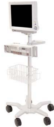
Roll Stand Kit AG-0018-60 Includes: Base/Casters/Post, Counterweight, Handle, Utility Basket, Mounting Plate for IntelliVue Table Top Adapter, and Flexible Module Server (FMS) mount.