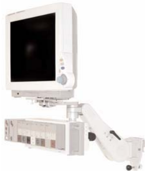
VHM™ Variable Height Support Arm – Rail Kit AG-0018-27 Includes: VHM Arm for 8-10 x 25-40 mm horizontal applications, Mounting Plate for IntelliVue Table Top Adapter, and Down Post for Flexible Module Server (FMS).