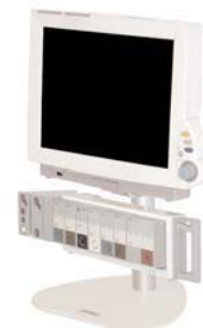
"Duckfoot" Pedestal Mount AG-0018-36 Freestanding system mount. Includes: Base/post, Mounting Plate for IntelliVue Table Top Adapter, and Flexible Module Server (FMS) mount.