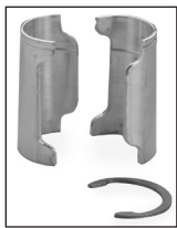
Aluminum Split Sleeve