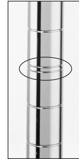
SiteSelect Posts feature double grooves every 8" (203mm) to aid assembly.