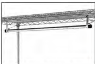
Garment Hanger Tube with Brackets