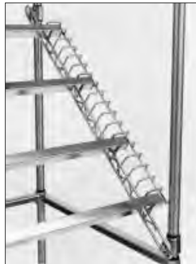
Close-up of Carrier Assembly