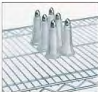
Clear Shelf Inlays