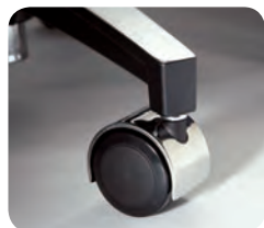
Classic Series Soft Rubber Casters