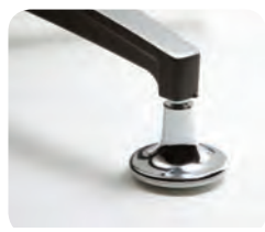
Classic Series Glides