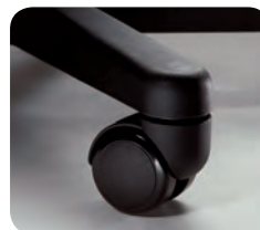
Value Series Soft Rubber Casters