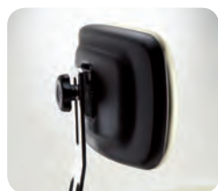
Classic and Value Series Backrest

© Midmark Corporation 2005 Products subject to improvement changes without notice. Litho in U.S.A. 007-0558-00 Rev. D1 (3/08)