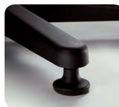
Value Series Glides