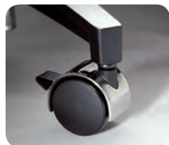
Classic and Value Series Locking Casters