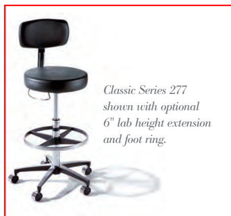
Classic Series 277 shown with optional 6" lab height extension and foot ring.