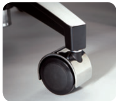
Classic Series Soft Rubber Casters