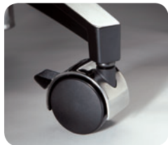
Classic and Value Series Locking Casters