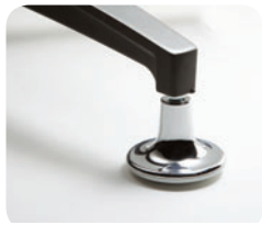
Classic Series Glides