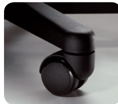
Value Series Soft Rubber Casters