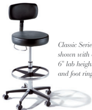
Classic Series 277 shown with optional 6" lab height extension and foot ring.