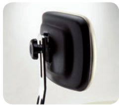
Classic and Value Series Backrest

© Midmark Corporation 2005 Products subject to improvement changes without notice. Litho in U.S.A. 007-0558-00 Rev. D1 (3/08)