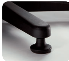
Value Series Glides