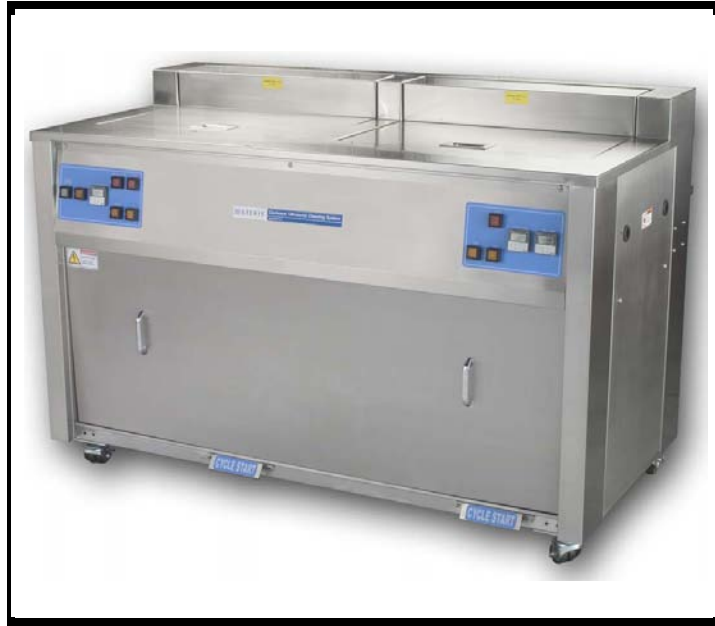
(Typical only - some details may vary.)