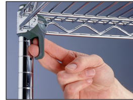
Corner Release System