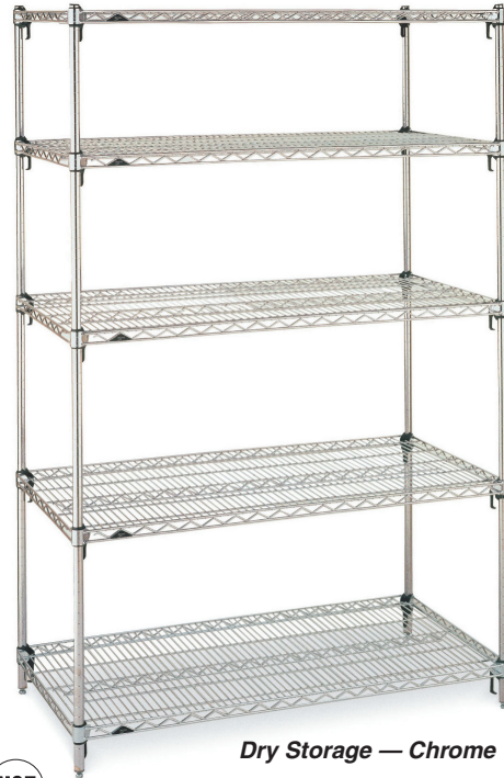
Dry Storage — Chrome