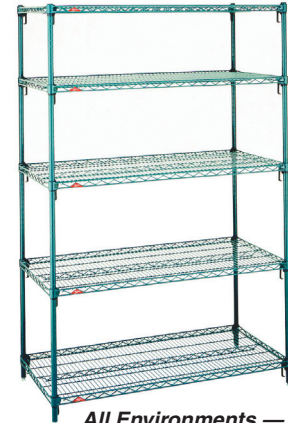
All Environments — Metroseal 3™ with *Microban® Antimicrobial Product Protection