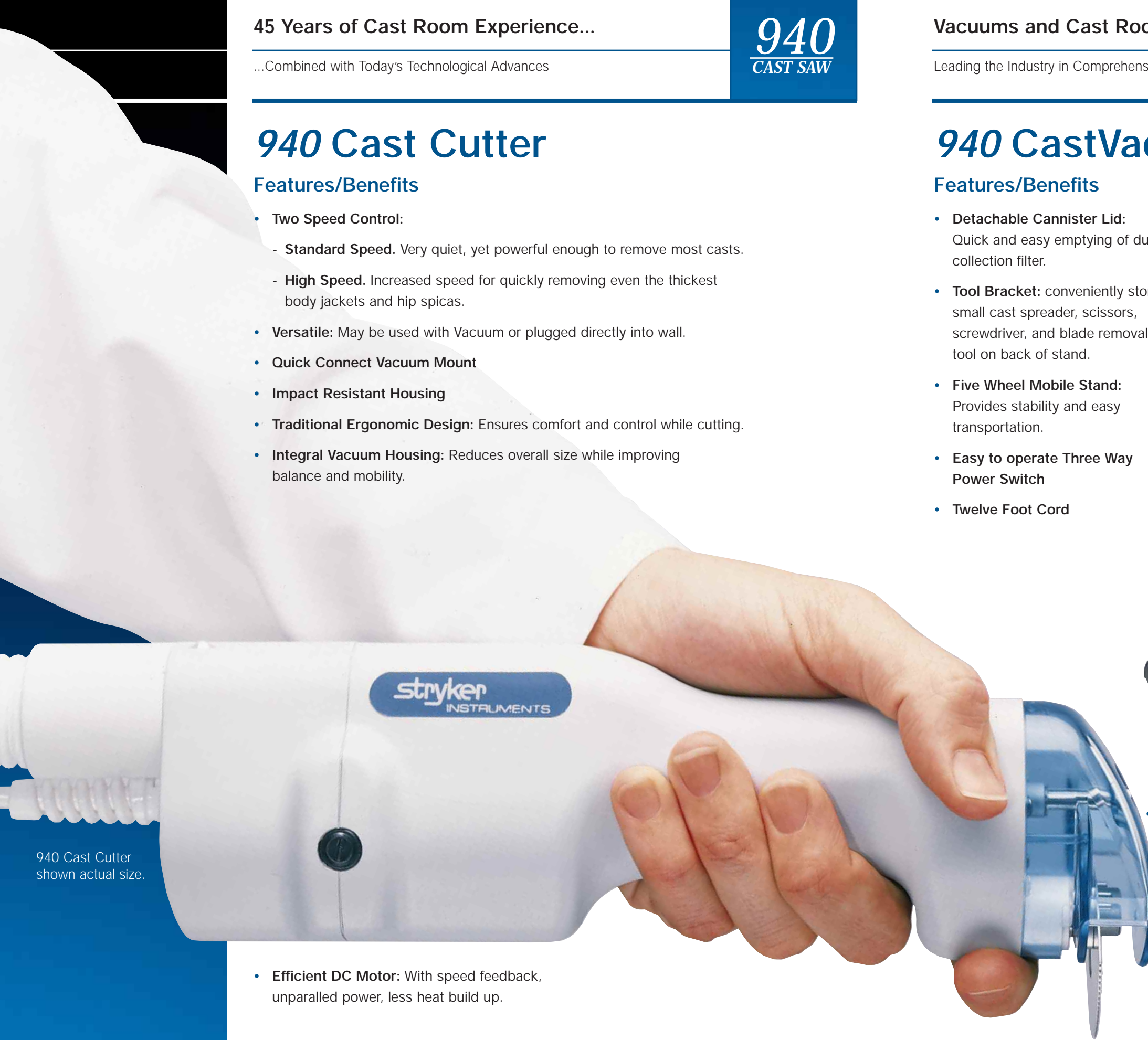
940 Cast Cutter shown actual size.