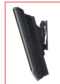
Adjustable +15/-5° tilt