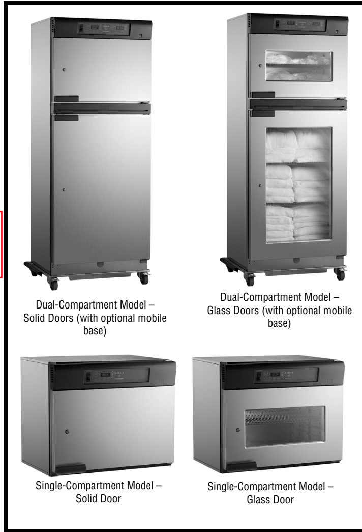
Dual-Compartment Model – Solid Doors (with optional mobile base)